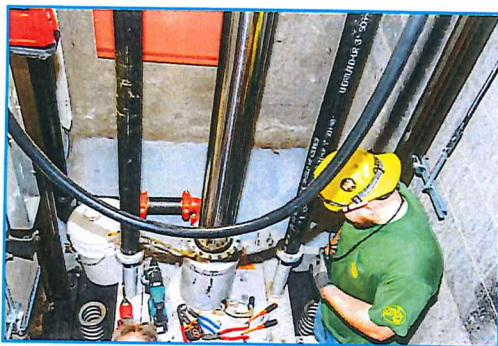
Pictured above, an Otis Elevator technician works on the hydraulic cylinder in the elevator shaft at 408 Adams Apartments.