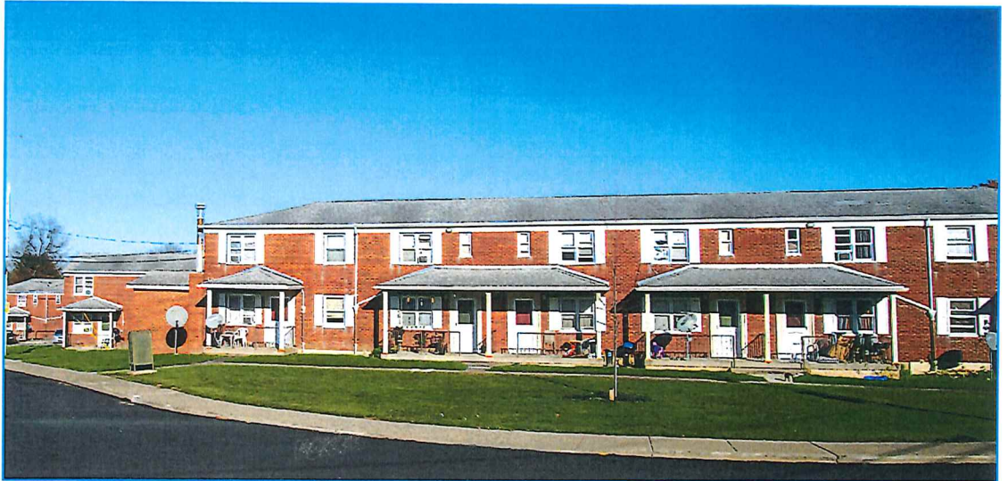
Above, pictured are some of the apartment buildings at SHA's Hilltop Manor Apartments slated for roof refurbishment. The construction project is slated to get underway in late 2022.

Work will begin in late 2022, weather permitting. Work crews have indicated that they expect to begin anytime with tear off of old roofing shingles.