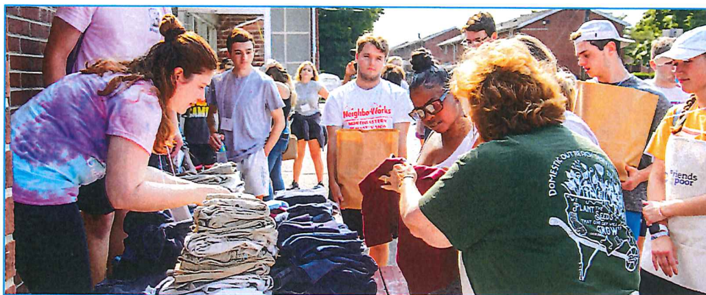
Pictured above, U of S students coordinate and distribute back-to school supplies, clothing and food items at SHA's Bangor Heights Community Center Building.

for a Thanksgiving dinner were provided to families residing at Valley View Terrace, Bangor Heights and Hilltop Manor. The University's Feed-a-Family Program began in 2003 and has since grown with local community partners. Coordinated with the SHA and Friends of the Poor, the student volunteers assembled and distributed 150 food baskets to SHA families which included turkeys and all the trimmings for a traditional Thanksgiving dinner.